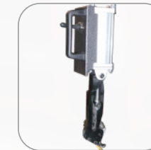
Leverless mounting head 自动翻转鸟头