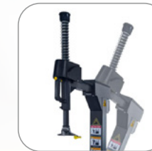
Tilting column design 后仰倒臂设计