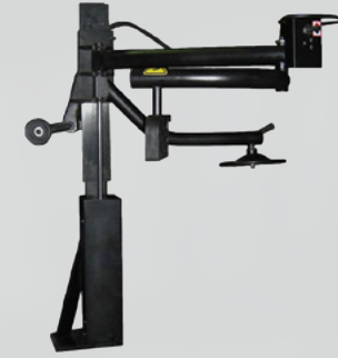
Monster Assist Arm (Right side) 辅助臂 (右)