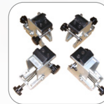
Motorcycle clamp adapters 摩托车夹具