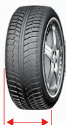
≤ 330mm (13") Max. wheel width 轮胎最大宽度