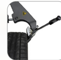
Strong tyre press 铲胎轻松省力