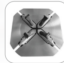
24" clamping range 24寸工作盘