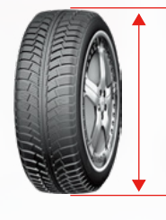
≤ 1040mm (41") Max. wheel diameter 轮胎最大轮径