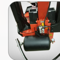
Quick air booster 快速爆充