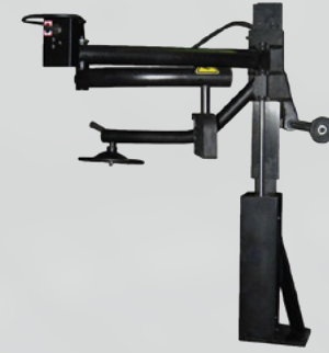
Monster Assist Arm (Left side) 辅助臂 (左)