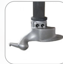
Mounting head 拆胎鸟头