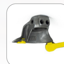
Motorcycle mounting head 摩托车鸟头